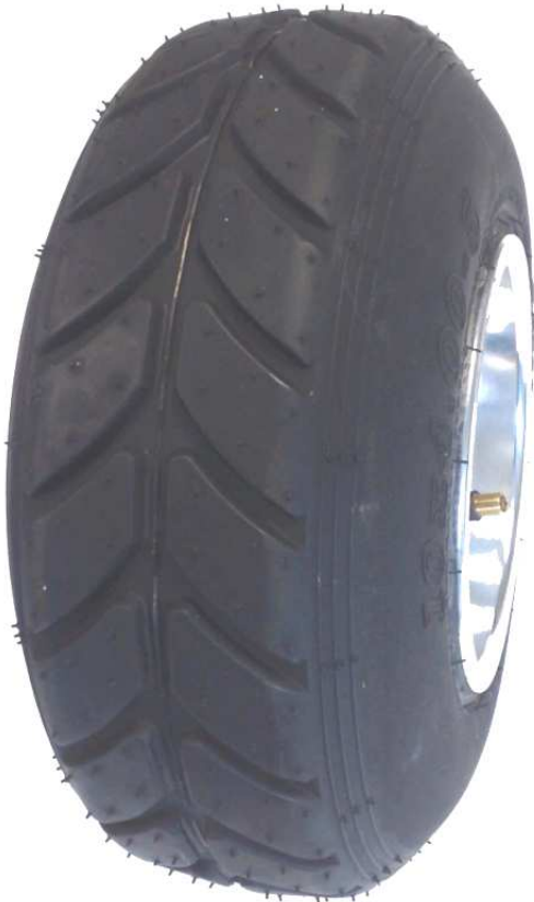
PHOTO OF THE TYRE FITTED TO THE RIM

This Homologation Form reproduces descriptions, illustrations and dimensions of the tyre